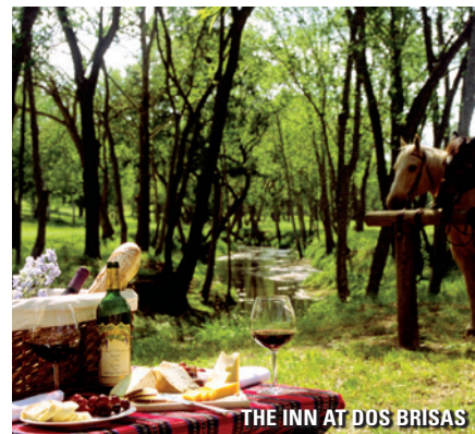
THE INN AT DOS BRISAS

Named for the father of our country, Washington County is a top destination for history buffs, antique hunters, music lovers and wildflower enthusiasts. Small towns with evocative names like Independence, Mount Vernon and William Penn dot the rolling landscape in southeast Central Texas, and the county seat of Brenham draws visitors to its historic downtown. Visit a working ranch, attend a world-renowned concert series, or enjoy a quiet stroll through a history-making spot by the Brazos River — none other than the birthplace of the Lone Star State itself.